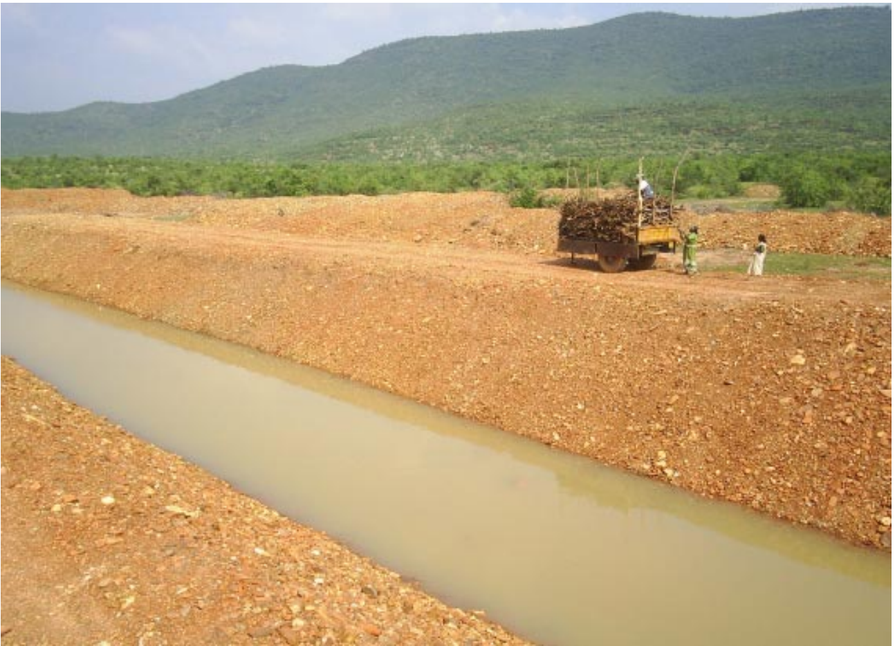
Roads along the Telugu-Ganga Canal would pave way for more illicit woodcutting in and around the Sanctuary area and also facilitate the woodcutters to commute easily

Jerdon's Courser is known to be regularly present.