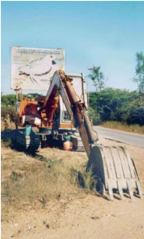
The Jerdon's Courser possesses the highest category of threat for a wild population defined by IUCN — Critically Endangered

“The shocking thing about this Canal construction is that the Telugu-Ganga Canal authorities have not obtained permission for working in the forest from the Andhra Pradesh Forest Department.”