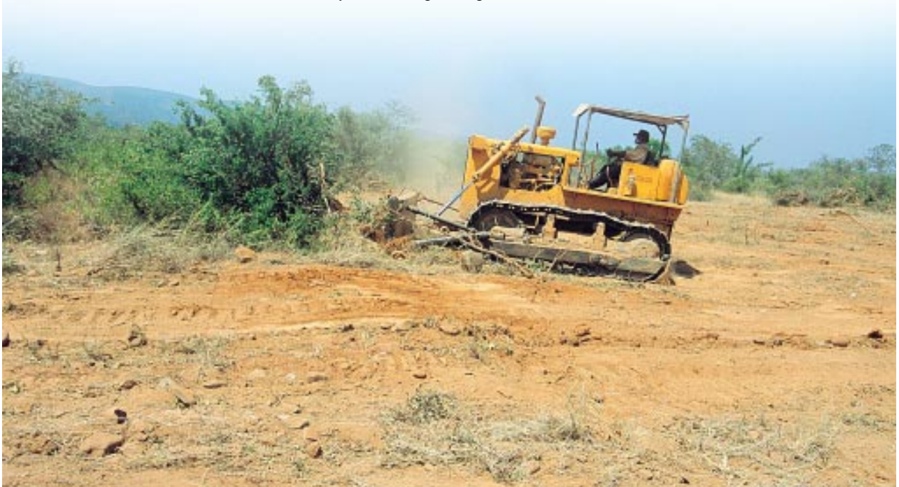
Nearly 22 ha of the suitable habitat of the Jerdon's Courser was cleared near the Sri Lankamaleswara Wildlife Sanctuary for the Telugu-Ganga Canal construction

From this place we have seen the Jerdon's Courser on several occasions. We have confirmed the footprint of the Jerdon's Courser, identified and recorded the call of the Jerdon's Courser, we have got the footprint of a young Jerdon's Courser and now we are trying to catch them for radio-telemetry studies. The place has doubled as a laboratory for our scientific studies for the last five years and it is the only place in the world, at the moment, where the